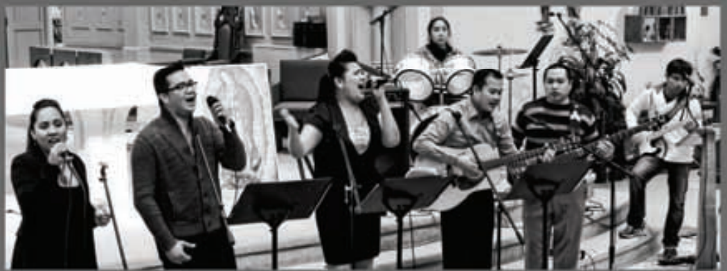
ARAMICO GOSPEL CHOIR